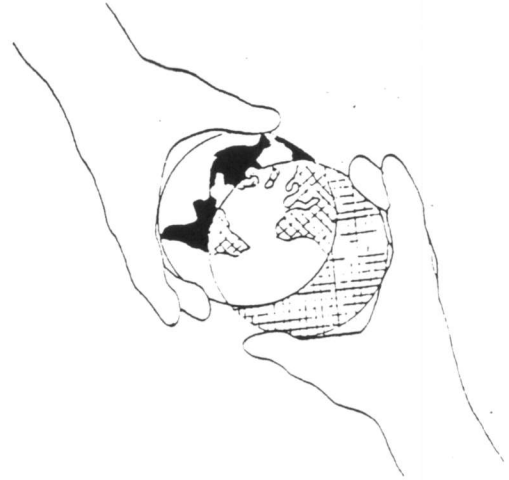
CPSR logo indicating intersection of world and silicon wafer in caring hands by Connie Palmer